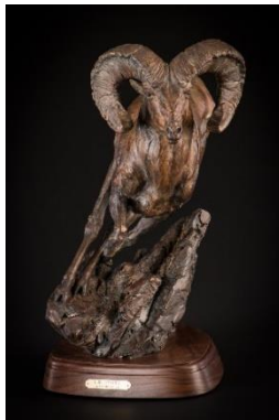
"Cliff Hanger" in Bronze