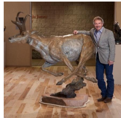
Phippen Museum ~ "Express Male" Monument